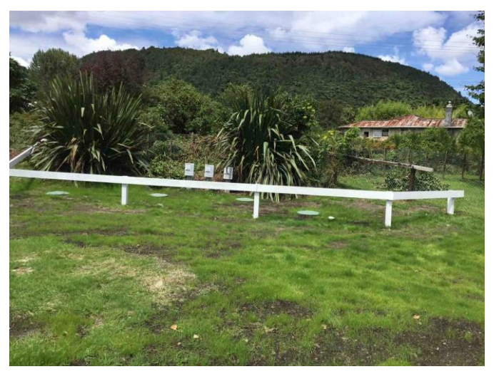
Rotoiti School System Install