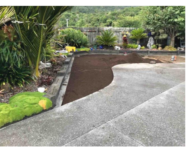
Partial reinstatement of the same property