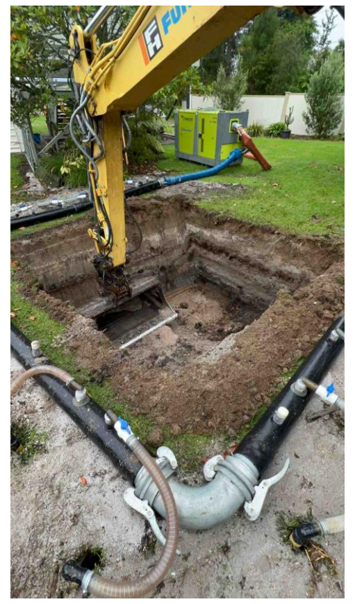
Commencement of the system install at a property requiring the ground water to be lowered (dewatering)

Existing drain laying complications that required a full reconfiguration