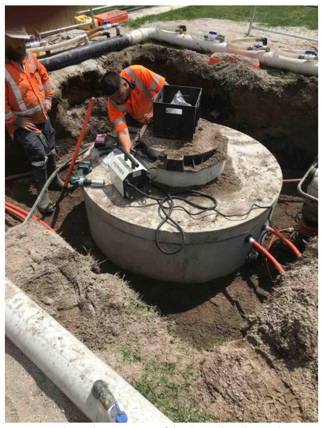
Completing the connections of the electrical conduits and discharge pressure line.

Tight space for the hiab to access the agreed concrete treatment system location