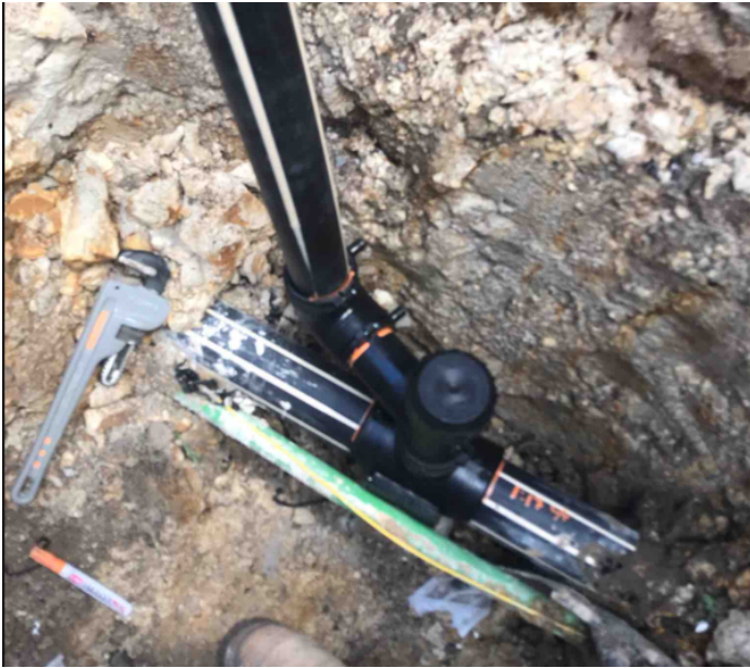
Saddle Connection to main line