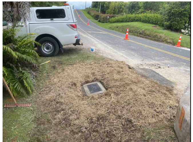
Hay Mulch Protection to encourage grass growth