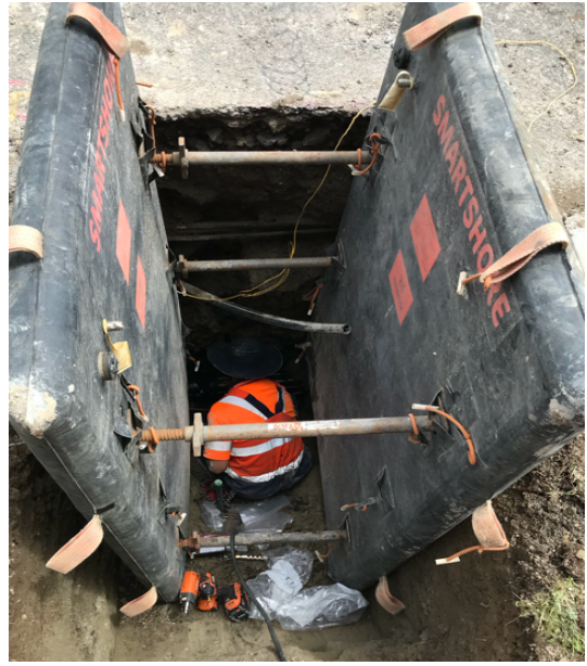
Trench Shield Protection of worker

Kei te mihi tonu ki a koutou i te āhuatanga o ngā mahi e whakatutukihia ana i ngā kōkiritanga o Tarawera. Kia noho haumaruru tonu mai, kia noho ora tonu mai koutou.