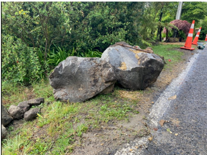
Rocks being removed during Boundary Assembly install