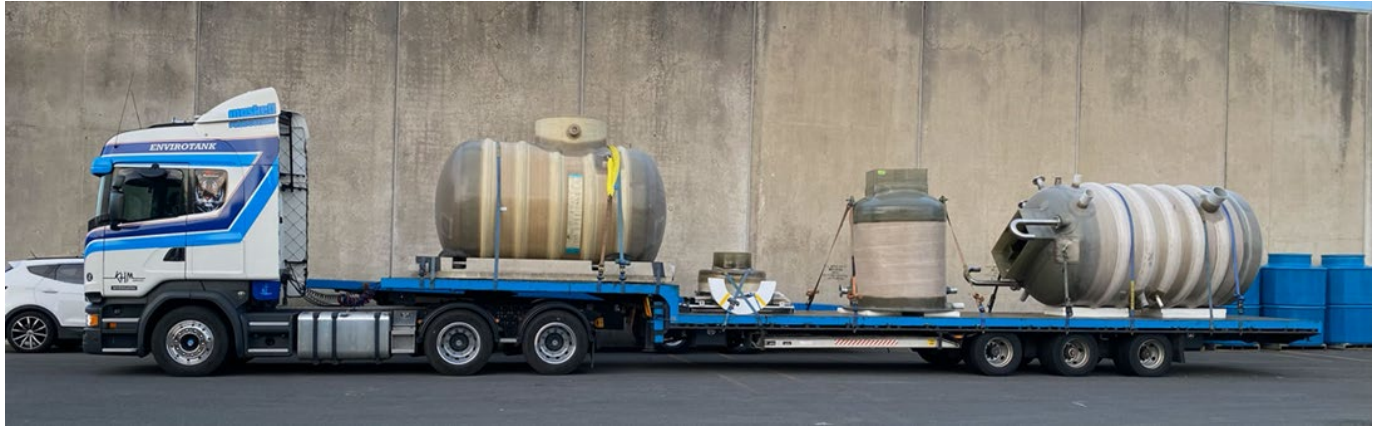
Chambers for the Cliff Road Pump Station

We ask that you please respect our team and travel safely through the worksites. Stick to the posted speed limit, drive carefully, and follow signage and any instructions you receive. Whether they're managing traffic to keep you safe or they're on the tools, the last thing we want is for our workers to cop abuse, be injured, or worse. Just as they work to make sure you can get to your destinations safely; our team need to be able to complete their tasks and return safely to their families each day.